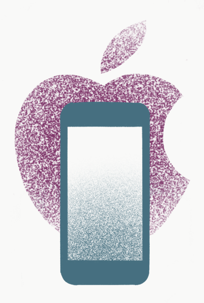
Visit the Apple store at Carnegie Library and discover hands-on educational sessions with local storytellers, chefs and artists.