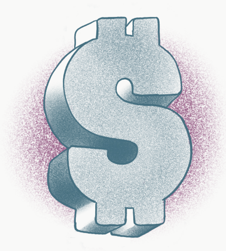
Explore over 1,000 tech start-ups and learn why DC is a top 10 U.S. city for venture capital investment.