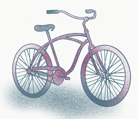
Cruise the National Mall on wheels from Capital Bikeshare or tour the Innovation Wing at the Smithsonian National Museum of American History.